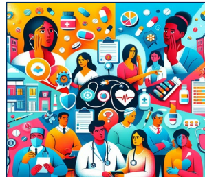
#6: Consumer trust further challenged