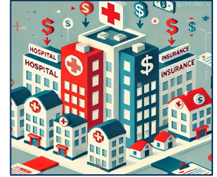
#4: Consolidation continues