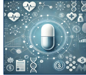
#3: Rx innovation is accelerating