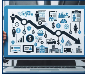
#2: Margin will be further pressured