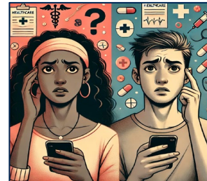
#7: Consumer frustration grows