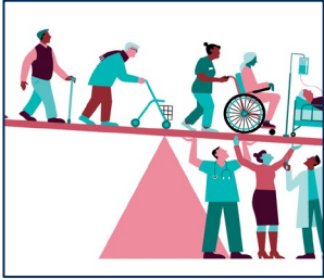
#1: Demand & workforce collide