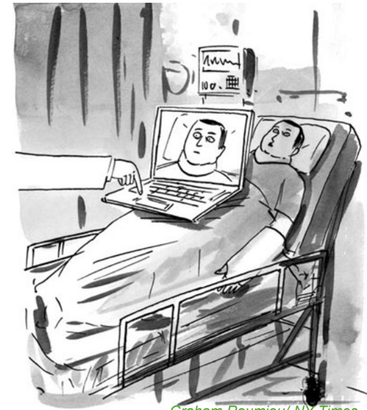
Graham Roumieu/ NY Times